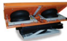
Dual Tilt on Single Lift Module