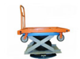
Lift/Tilt Cart Positioning