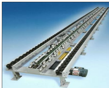
Air-Chain Accumulation Conveyor