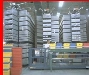
Vertical Lift Module